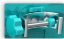
90° rotatable pole clamp