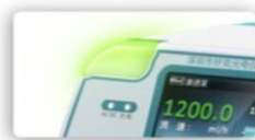
Alarm indicator light